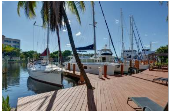
906 NE 20th Ave