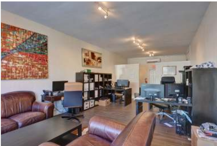
906 NE 20th Ave