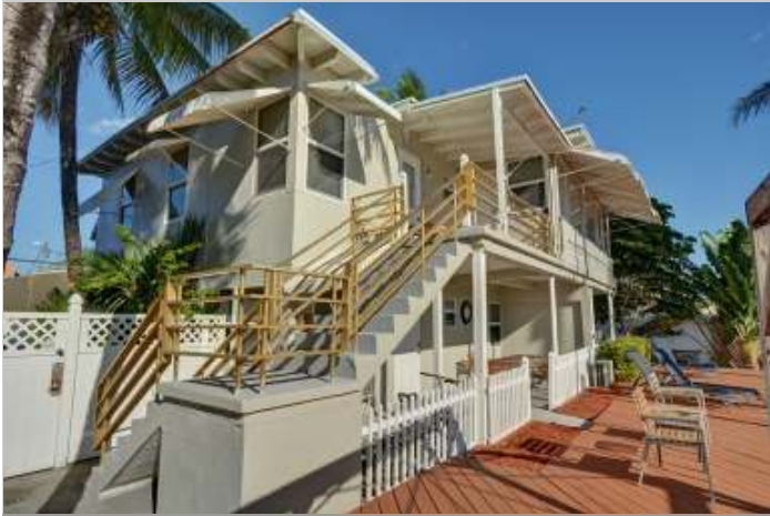
906 NE 20th Ave