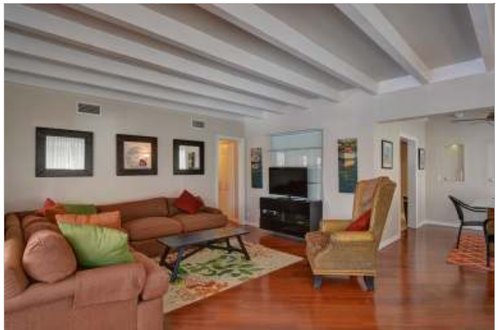
906 NE 20th Ave