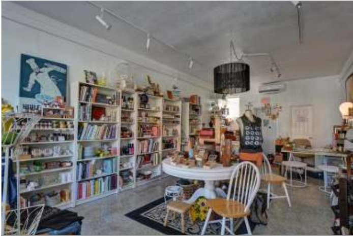
906 NE 20th Ave