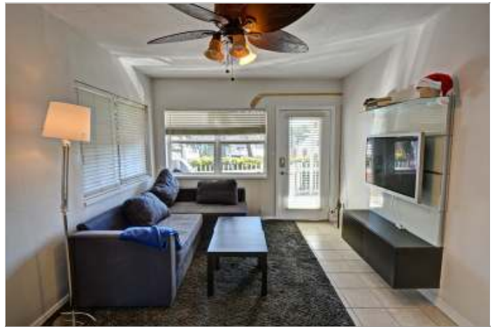
906 NE 20th Ave