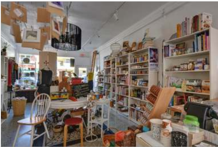
906 NE 20th Ave