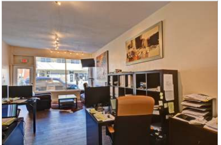
906 NE 20th Ave