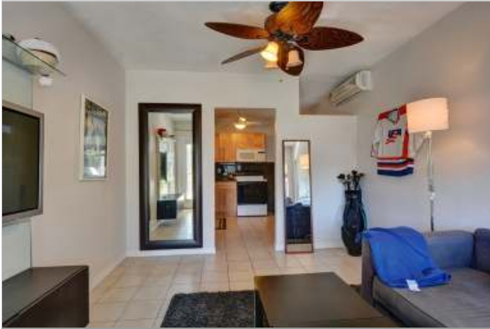
906 NE 20th Ave