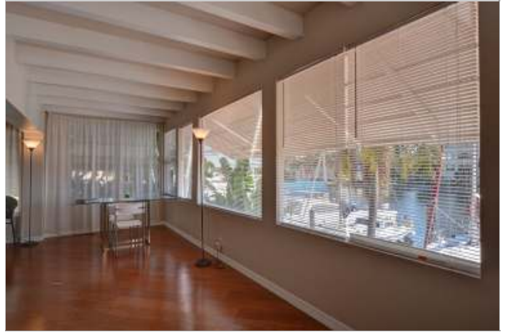
906 NE 20th Ave