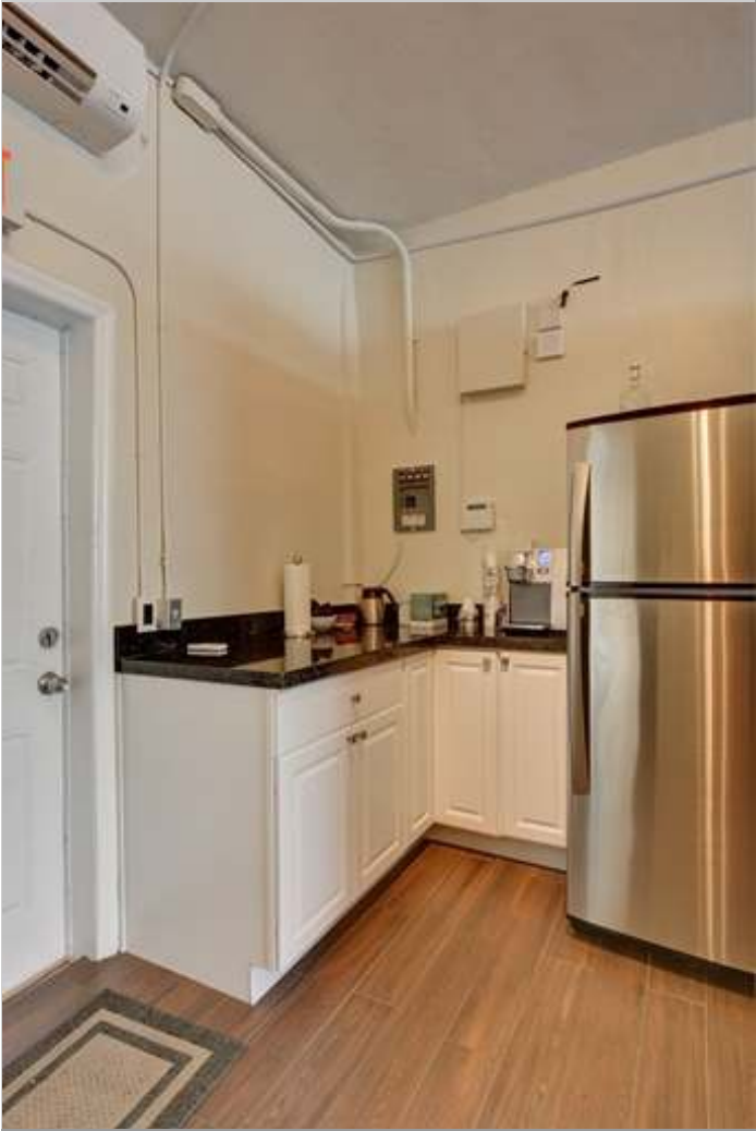
906 NE 20th Ave