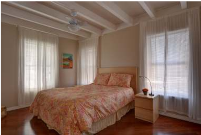
906 NE 20th Ave