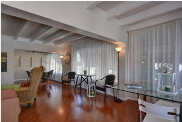
906 NE 20th Ave