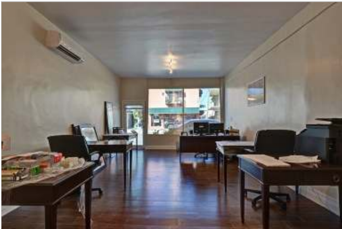
906 NE 20th Ave