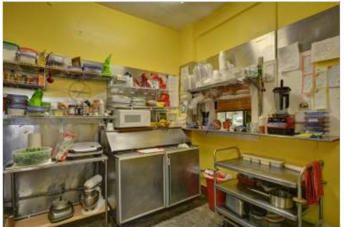
906 NE 20th Ave