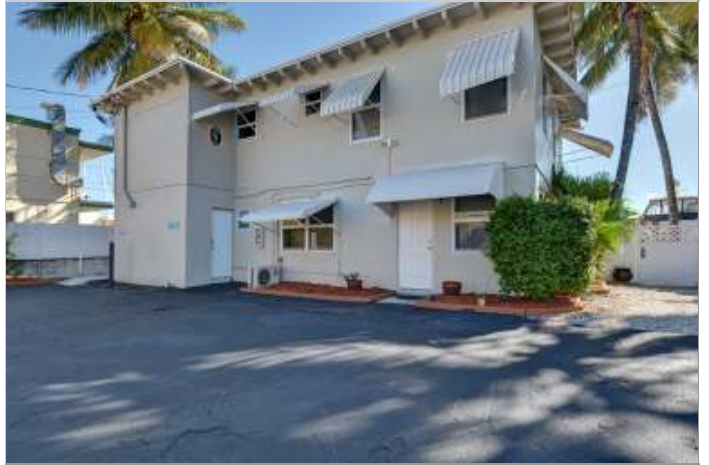
906 NE 20th Ave