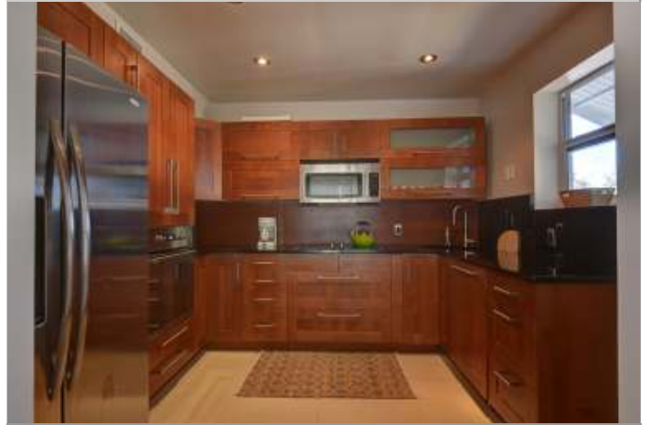
906 NE 20th Ave