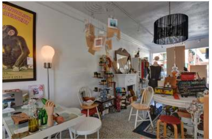
906 NE 20th Ave