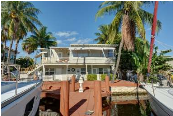
906 NE 20th Ave