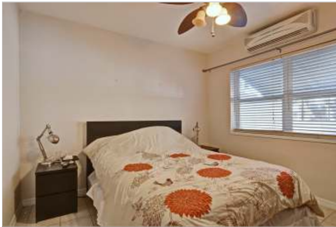
906 NE 20th Ave