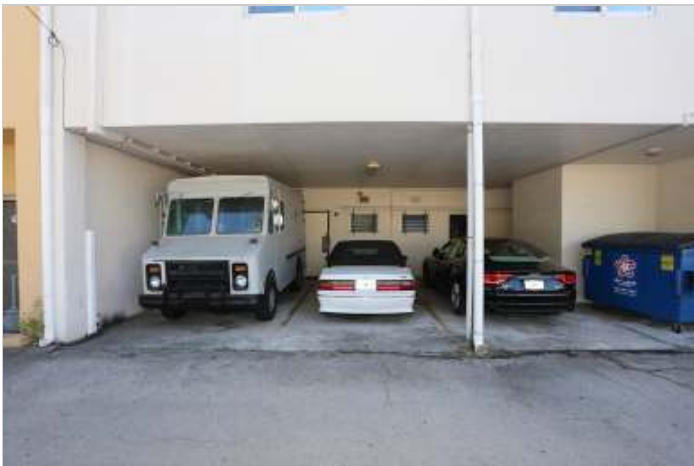
2811 E Commercial Blvd