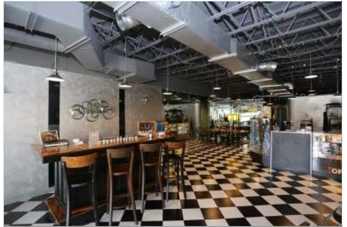
2811 E Commercial Blvd