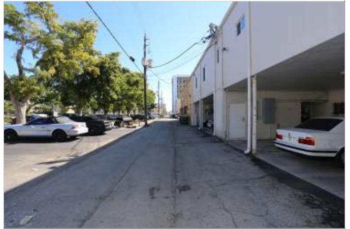
2811 E Commercial Blvd