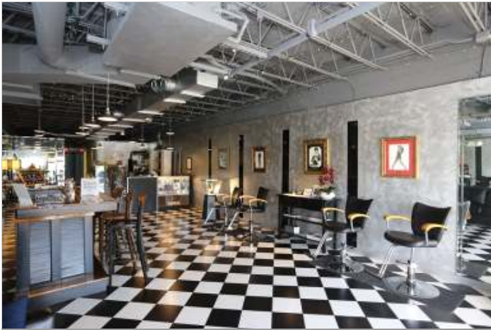
2811 E Commercial Blvd