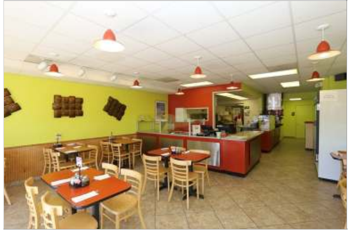
2811 E Commercial Blvd