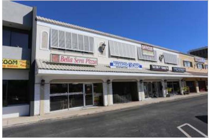
2811 E Commercial Blvd