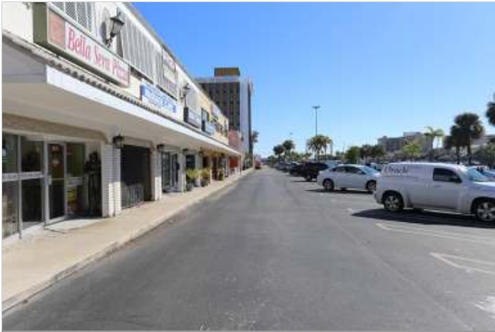
2811 E Commercial Blvd