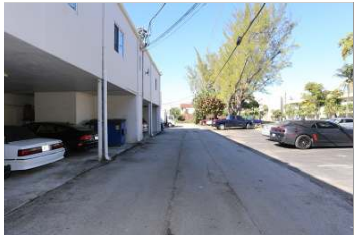
2811 E Commercial Blvd