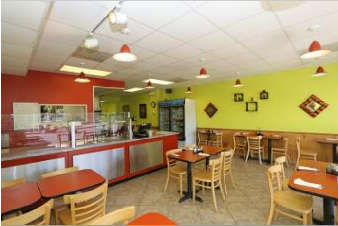
2811 E Commercial Blvd