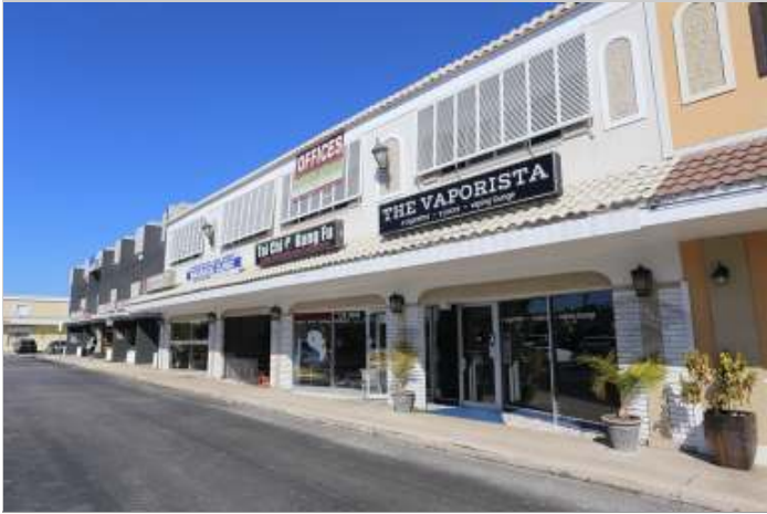
2811 E Commercial Blvd